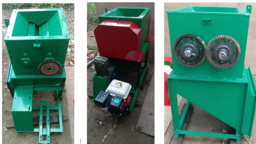
Gambar 2. Implementation of coconut peeler tool.

In early September 2023, pengabdian has been finishing the working drawing design of the coconut skin peeler. The results of this design are used as a reference for purchasing the materials needed to make the tool. The estimated processing time required for the production process of this peeler is 1 month. As a result of the discussion between the leader and the service members, it was decided to involve a third party in making the peeler based on the design drawings. This was done because of the short time for the implementation of the service which is planned to be carried out in early November 2023. Figure 2 shows the implementation of the peeler that has been completed in accordance with the initial design designed by the team.